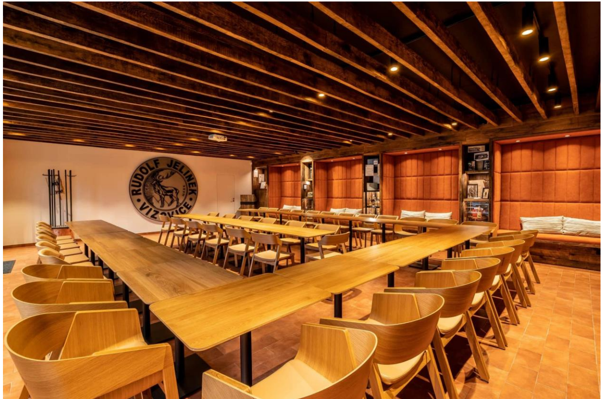
Figure 1 The R. Jelinek Slivowitz Museum where the club meets on Monday nights at 6pm

I was of course curious about Prague in general and the Czech Republic. Also known as "Czechia" it was historically known as "Bohemia" in Central Europe. I've included a map (Fig 2) that shows the Czech Republic in relation to neighbouring countries like Germany, Poland, Slovakia, Austria, and Hungary.