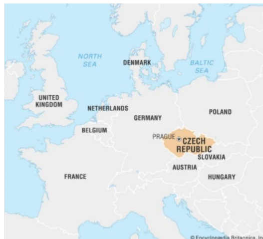
Figure 2: The Czech Republic (formerly Czechoslovakia) with neighbours in central Europe

I was of course curious about Prague in general and the Czech Republic. Also known as "Czechia" it was historically known as "Bohemia" in Central Europe. I've included a map (Fig 2) that shows the Czech Republic in relation to neighbouring countries like Germany, Poland, Slovakia, Austria, and Hungary.